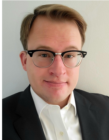
Senior SMART IRB Officer